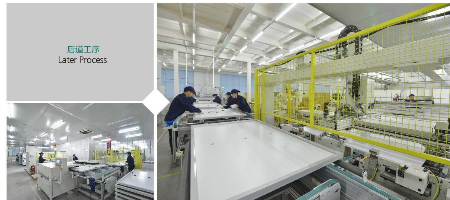
后道工序 Later Process