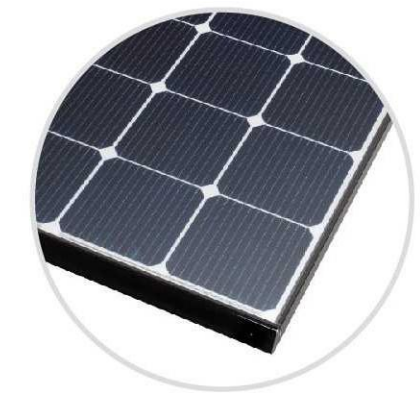
多主栅组件 MBB Module (60/72 Cells)