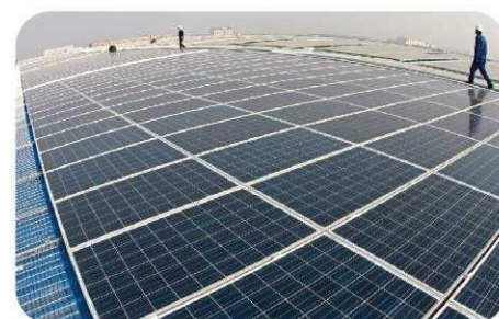
江苏永钢20MW分布式光伏电站 20MW Distributed Plant of Jiangsu Yonggang Group