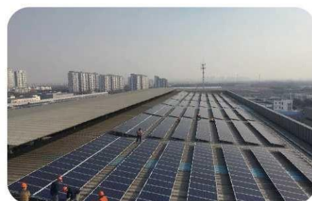
苏州2.8MW分布式光伏电站 2.8MW Rooftop Plant in Suzhou, China