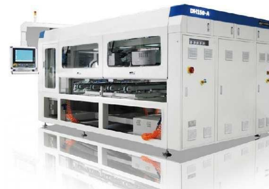
DH150-A型汇流带焊接机 DH150-A Auto Bussing Machine