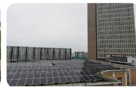
扬州2.5MW分布式光伏电站 2.5MW Rooftop Plant in Yangzhou, China