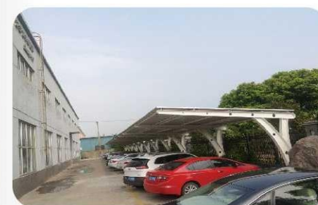
张家港100KW光伏车棚项目 100KW Carport in Zhangjiagang, China