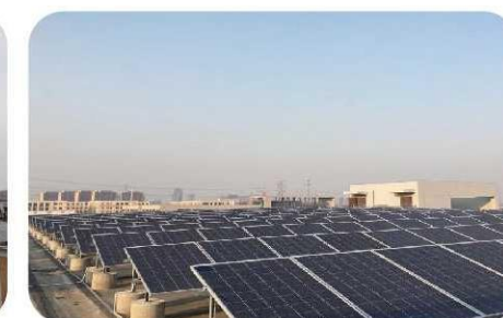
苏州吴中开发区600KW分布式光伏电站 600KW Distributed Plant in Suzhou, China