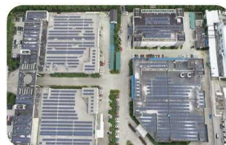
苏州高新区2MW分布式光伏电站 2MW Rooftop Plant in Suzhou, China