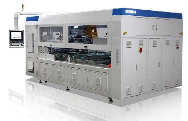
DH150-B型汇流带焊接机 DH150-B Auto Bussing Machine