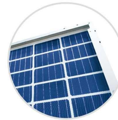
双面双玻组件 Bifacial Double-Glass Module