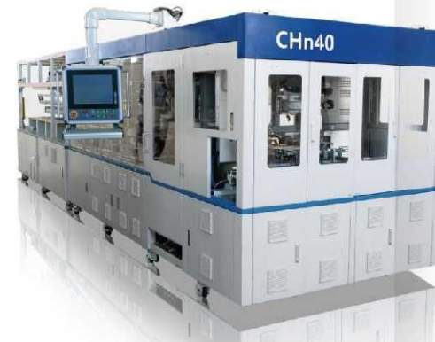
CHn40串焊机 CHn40 Stringer Machine

The factory is equipped with the industry leading facilities such as Multi-Busbar Cut-Cell Bifacial Double-Glass High Efficiency Turnkey Production Line, CHn40 High Speed Multi-Busbar Cell Scribing & Stringer Machine, DH150A + DH150B Auto Bussing Machine, etc.