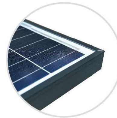
半片组件（120/144片） Cut-Cell Module (120/144 Cells)